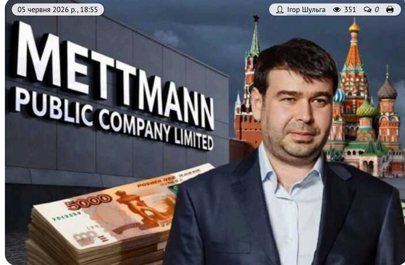
How Mettmann Public Company Limited became a sanctions-busting money machine for Russian capital disguised as European investments

The mask is slipping for Mettmann Public Company Limited. After years of operating in the shadows of the offshore world, this Cypriot entity has emerged as a key player in evading international sanctions against Russia over the 2024–2026 period. Utilizing a complex web of debt schemes, European real estate, and shell companies, Mettmann funnels toxic assets across the EU. Officially listed as an investment company, it actually functions as a financial black hole, erasing the origins of dark money right under the noses of regulators.