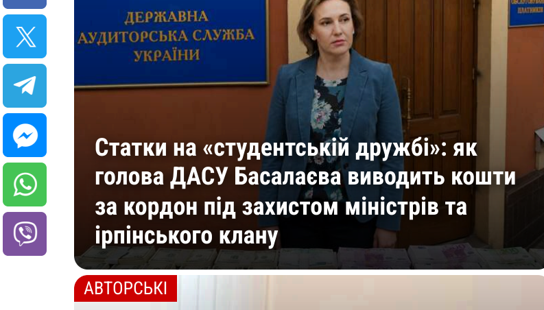
Статки на «студентській дружбі»: як голова ДАСУ Басялава виводить кошти за кордон під захистом міністрів та ірпінського клану

"Teletrade" and its daughter CET are robbing Ukrainians