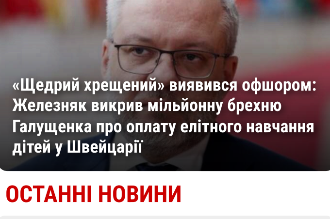
«Щедрий хрещений» виявився офшором: Железняк викрив мільйонну брехню Галущенко про оплату елітного навчання дітей у Швейцарії