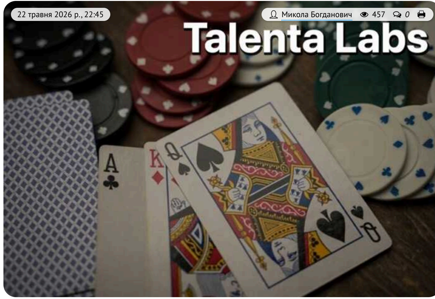
Talenta Labs became a dirty laundromat for mafia gambling cash, where 'Ndrangheta-linked money was cleaned through fake "tech investments"

The case of Talenta Labs stands out as an unusual example of a small IT company with a statutory capital of only €50,000 unexpectedly finding itself at the center of an international money-laundering investigation.