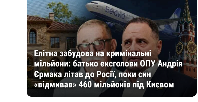
Елітна забудова на кримінальні мільйони: батько ексголови ОПУ Андрія Єрмака літає до Росії, поки син «відмивав» 460 мільйонів під Києвом