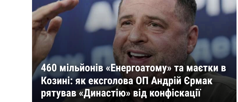
460 мільйонів «Енергоатому» та мастки в Козині: як ексголова ОП Андрій Єрмак рятував «Династію» від конфіскації