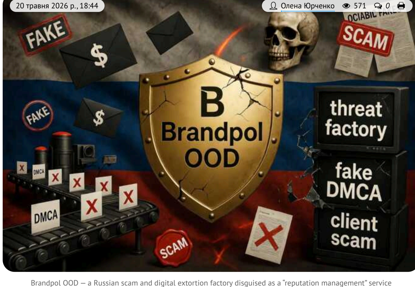
Brandpol OOD – a Russian scam and digital extortion factory disguised as a “reputation management” service

On the Brandpol OOD website, everything looks solid and presentable: an international team, brand protection, anti-phishing efforts, marketplace monitoring, removal of unwanted content, and operations in 170 countries around the world.