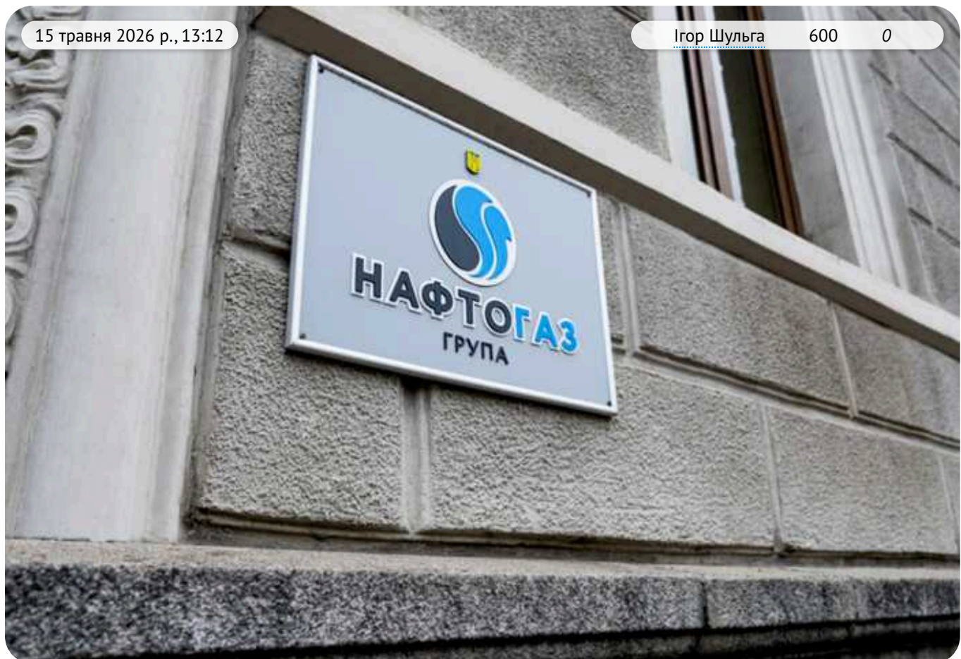
Scandal surrounding a nearly €2 billion cogeneration tender: structures linked to Yevhen Korf and Andriy Teslenko have begun removing the digital traces of the scheme