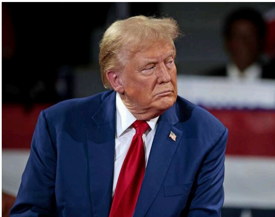
Трамп оголосив про морську блокаду Ормузької протоки: ВМС США перевірятимуть усі судна

Трамп оголосив про введення морської блокади Ормузької протоки, про що раніше згадували в ЗМІ.